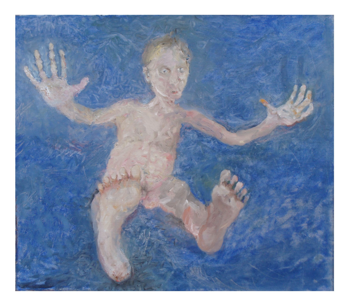
"Small figure", 46x38, oil on canvas, 2012