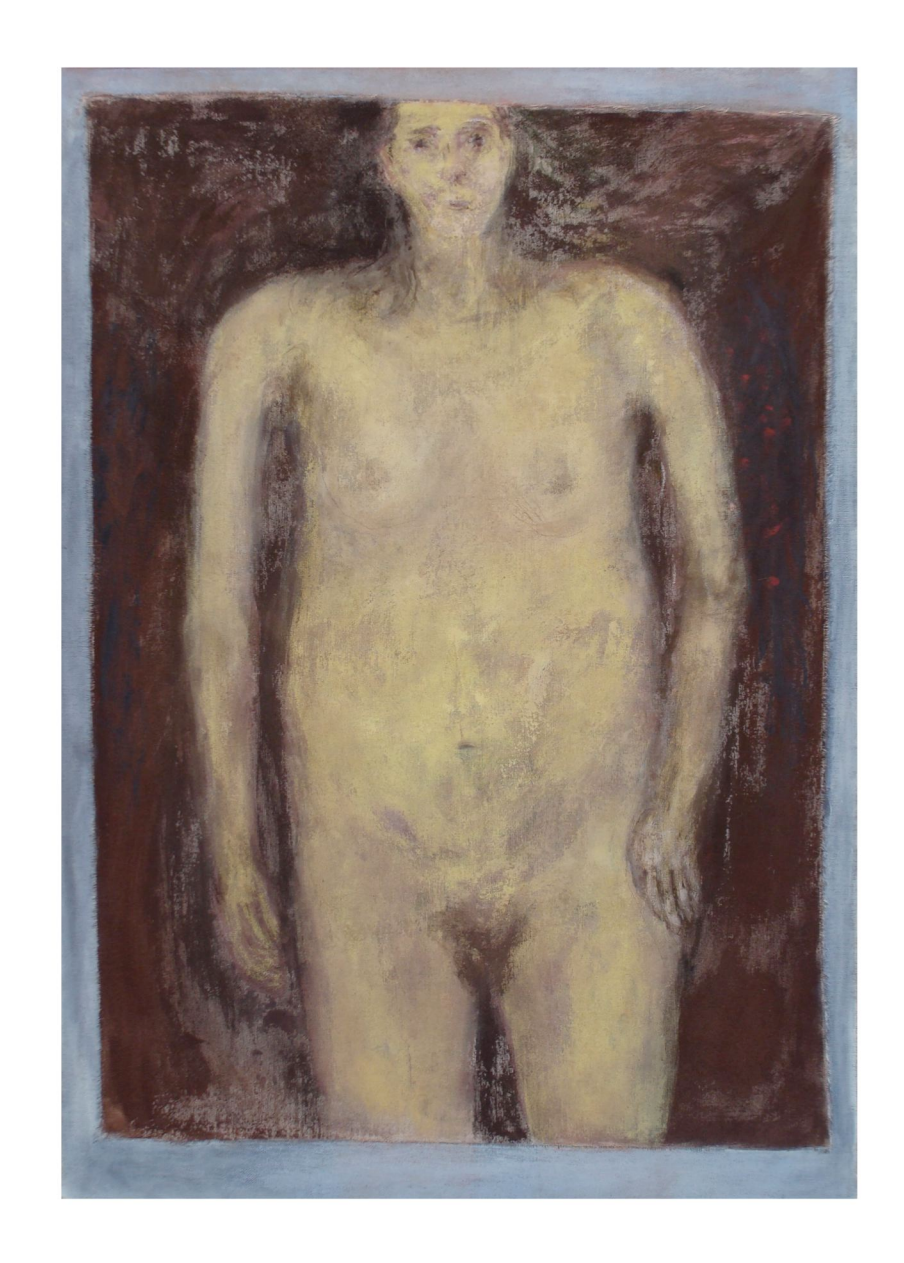
"Miror", 92x65, caséine on canvas, 2012