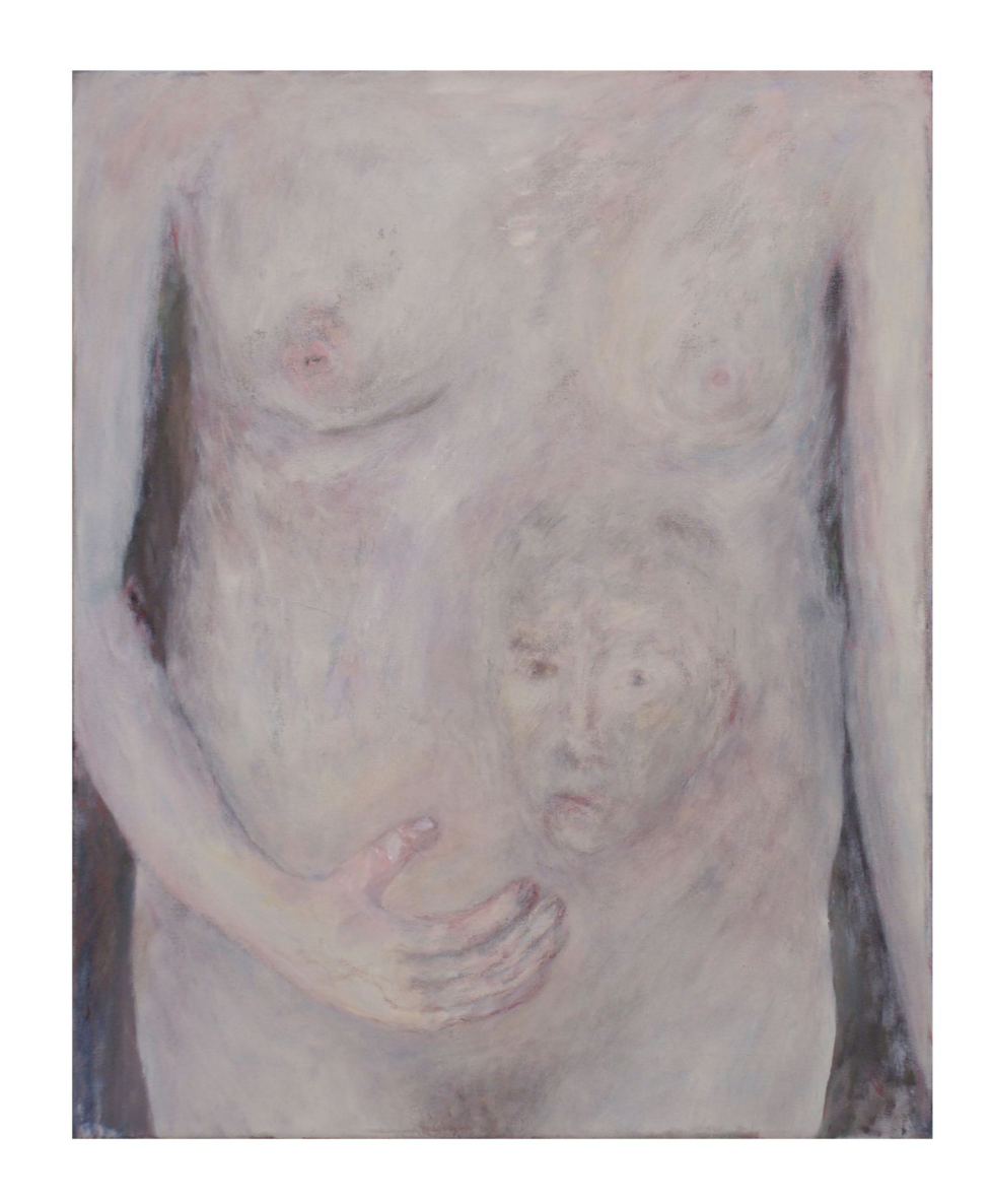
"Torso and head", 50x40, oil on canvas, 2012