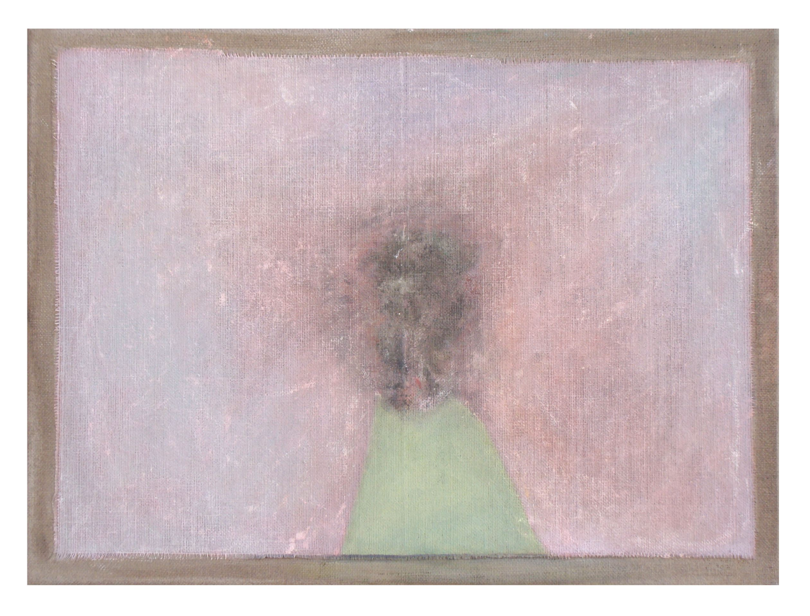
Untitled, 40x30, oil on canvas, 2013