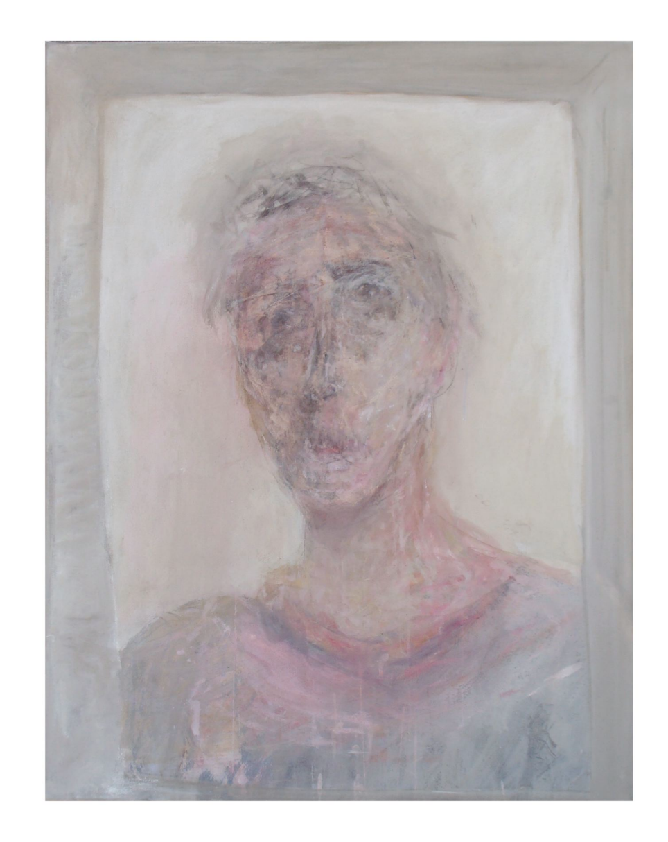
"Head", 71x55, caséine on canvas, 2012